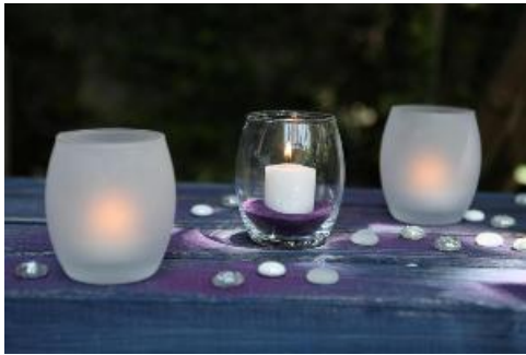
Roly Poly Type

All candles and holders must be approved by the UC Davis Fire Department prior to use. The following are the types of votive/tea light candles and holders are APPROVED :